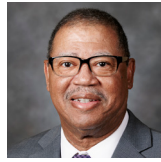
Sen. Victor Rountree District 3 - Bellevue