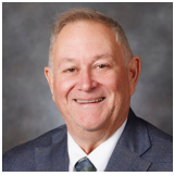
Sen. Bob Hallstrom District 1 - Syracuse