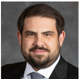
Sen. Eliot Bostar District 29 - Lincoln