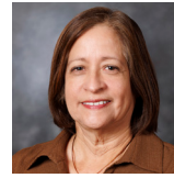
Sen. Margo Juarez District 5 - Omaha