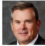
Sen. Brad von Gillern District 4 - Elkhorn