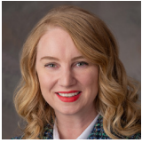
Sen. Megan Hunt District 8 - Omaha