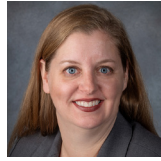
Sen. Wendy DeBoer District 10 - Omaha