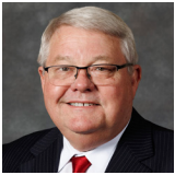
Sen. Rick Holdcroft District 36 - Bellevue