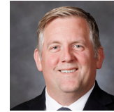
Sen. Jason Prokop District 27 - Lincoln