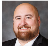
Sen. Dunixi Guereca District 7 - Omaha