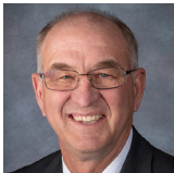
Sen. Myron Dorn District 30 - Adams