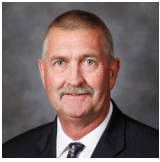
Sen. Dave Wordekemper District 15 - Fremont