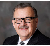
Sen. Mike Jacobson District 42 - North Platte