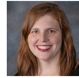
Sen. Machaela Cavanaugh District 6 - Omaha