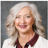
Sen. Tanya Storer District 43 - Whitman