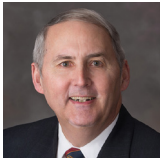
Sen. Robert Clements District 2 - Elmwood