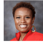
Sen. Ashlei Spivey District 13 - Omaha