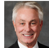
Sen. Loren Lippincott District 34 - Central City