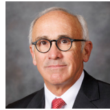
Sen. Tony Sorrentino District 39 - Elkhorn