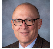
Sen. John Arch District 14 - Papillion