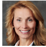
Sen. Christy Armendariz District 18 - Omaha