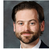
Sen. George Dungan District 26 - Lincoln