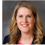
Sen. Carolyn Bosn District 25 - Lincoln