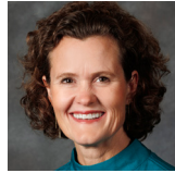
Sen. Jana Hughes District 24 - Seward