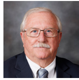
Sen. Glen Meyer District 17 - Pender