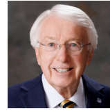
Sen. Merv Riepe District 12 - Ralston