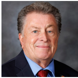
Sen. Stan Clouse District 37 - Kearney